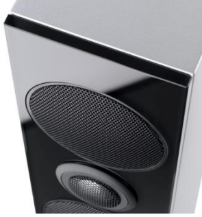
Shelf G70 front of glass