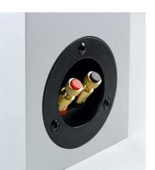
Shelf G70 terminals