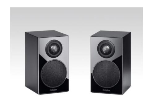
Mini G50 with black housing