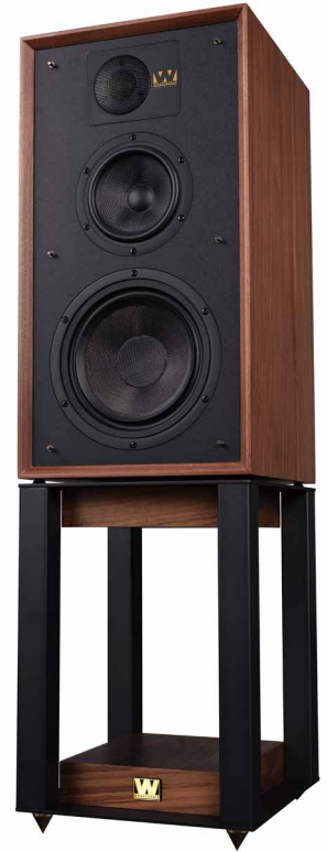
* Stand available separately