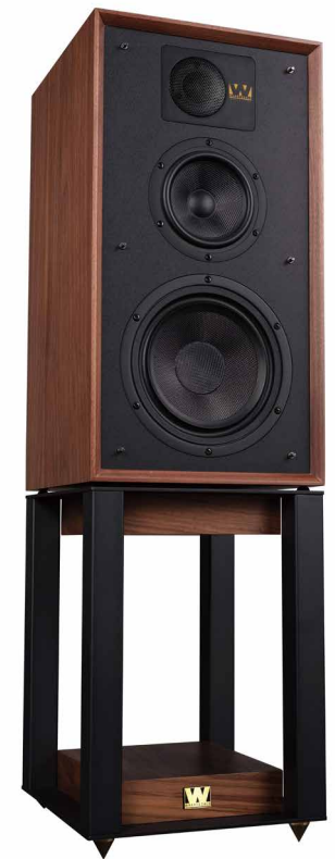
* Stand available separately

CONFIDENTIAL. SHARED UNDER NDA. NOT FOR PUBLIC DOMAIN.